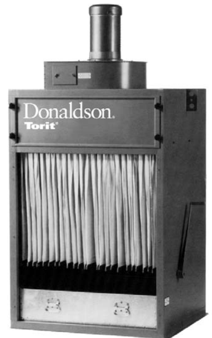
Cabinet 90 (door not shown)

Good choice for low-airflow, light-loading applications that do not require continuous airflow.